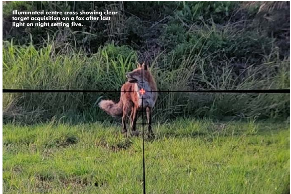
Illuminated centre cross showing clear target acquisition on a fox after last light on night setting five.

The outer part of the turret is a dial for