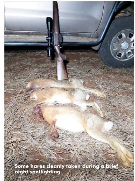
Some hares cleanly taken during a brief night spotlighting.