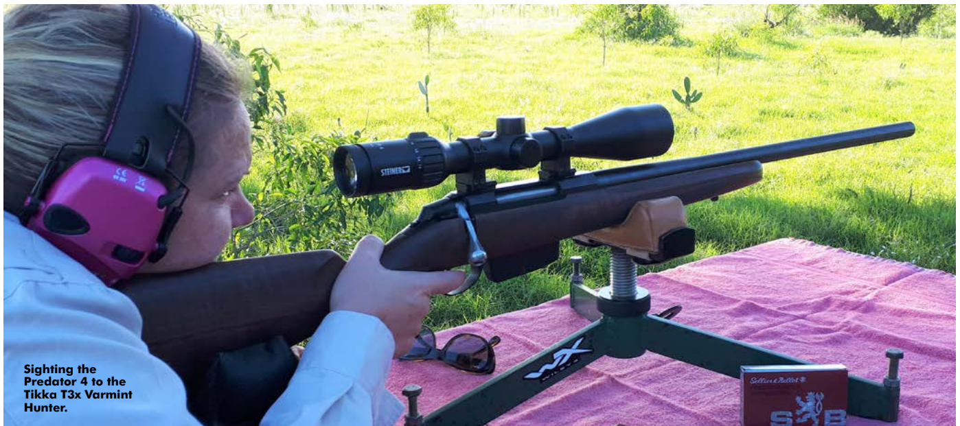
Sighting the Predator 4 to the Tikka T3x Varmint Hunter.