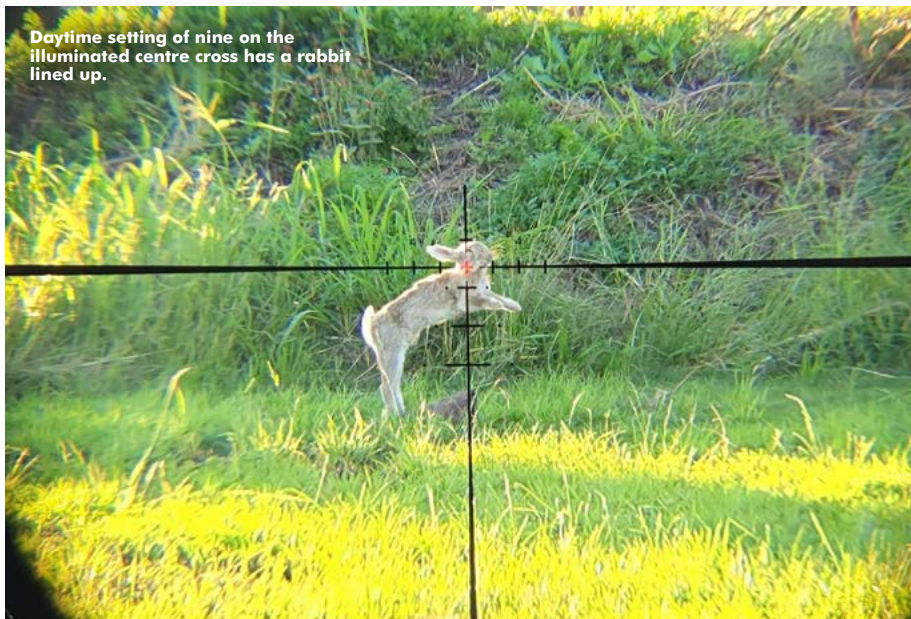
Daytime setting of nine on the illuminated centre cross has a rabbit lined up.

With our hunter class charity shoot weekend fast approaching we'd little time