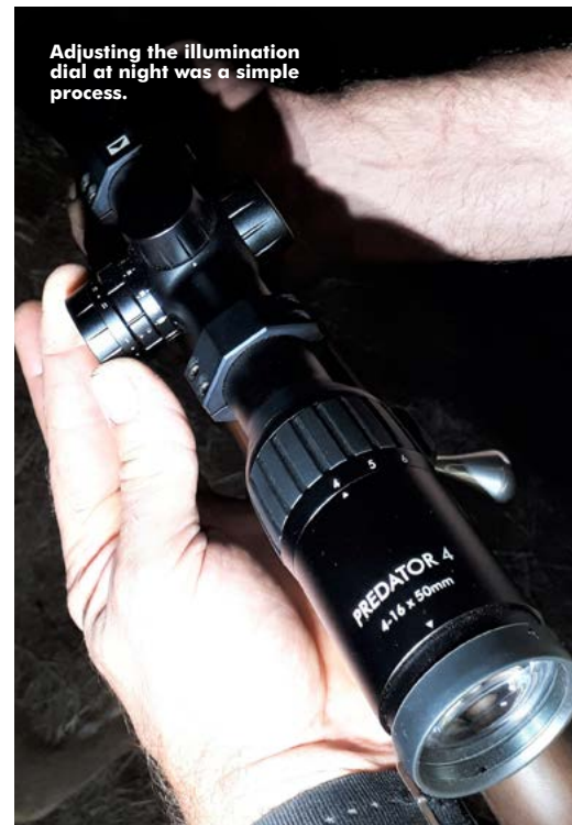
Adjusting the illumination dial at night was a simple process.

Mounting to the review Tikka with 70-degree bolt throw wasn't a problem and the bolt handle didn't foul with the ocular bell. The rubber dioptre ring is smooth but easily gripped for a clear image and reticle and like other Steiners I've tested the variable magnification dial is a ribbed rubber