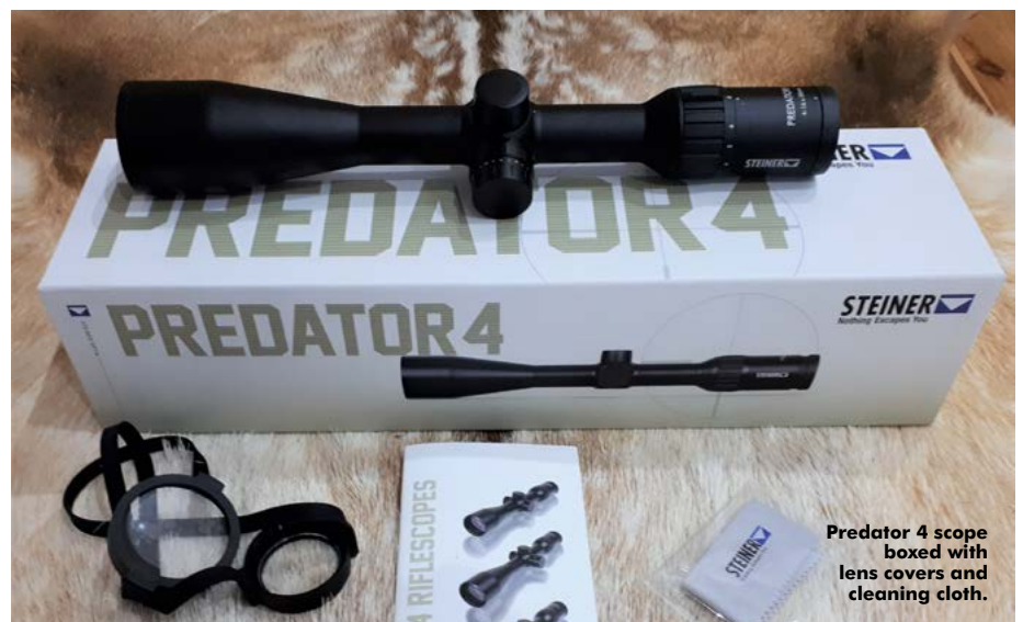
Predator 4 scope boxed with lens covers and cleaning cloth.